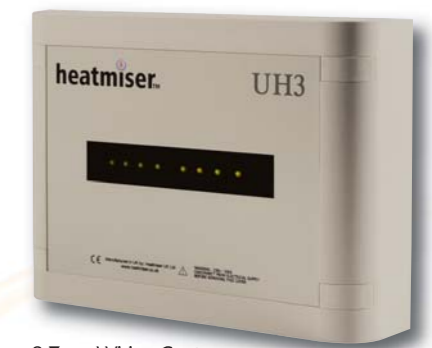
8 Zone Wiring Centre Part Ref: Heatmiser UH3