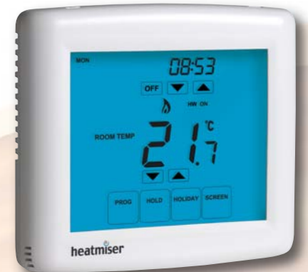
4 Zone Time Clock Part Ref: Heatmiser TM4