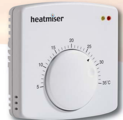
Set Back Thermostat Part Ref: Heatmiser DS-SB